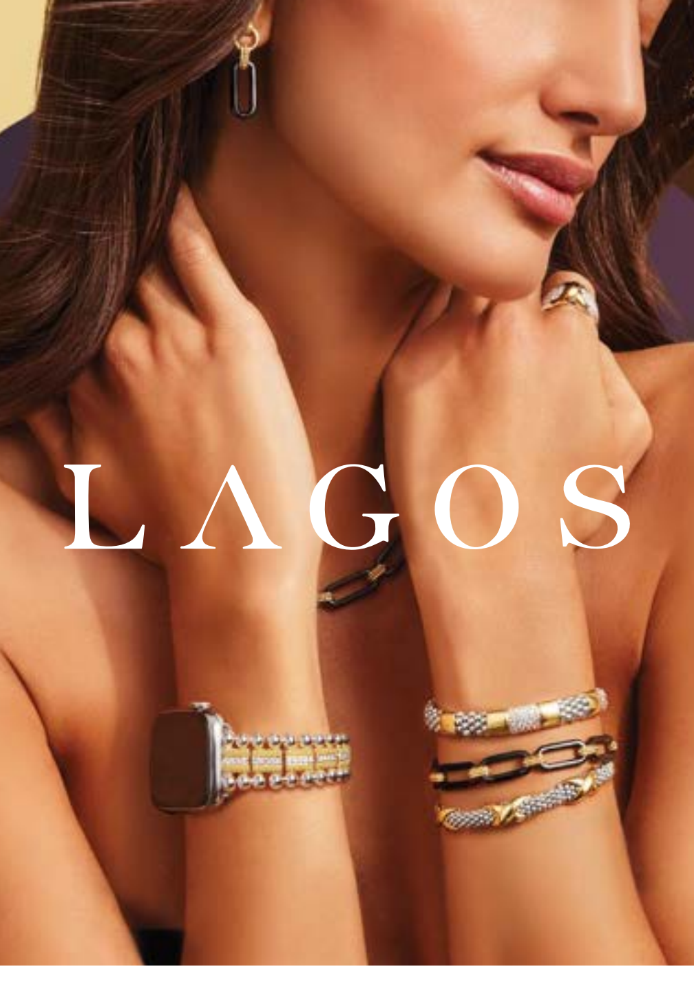
Sissy's Log Cabin