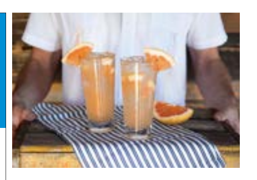
craving bright, fresh, cali-mex inspired dishes? keep it local.